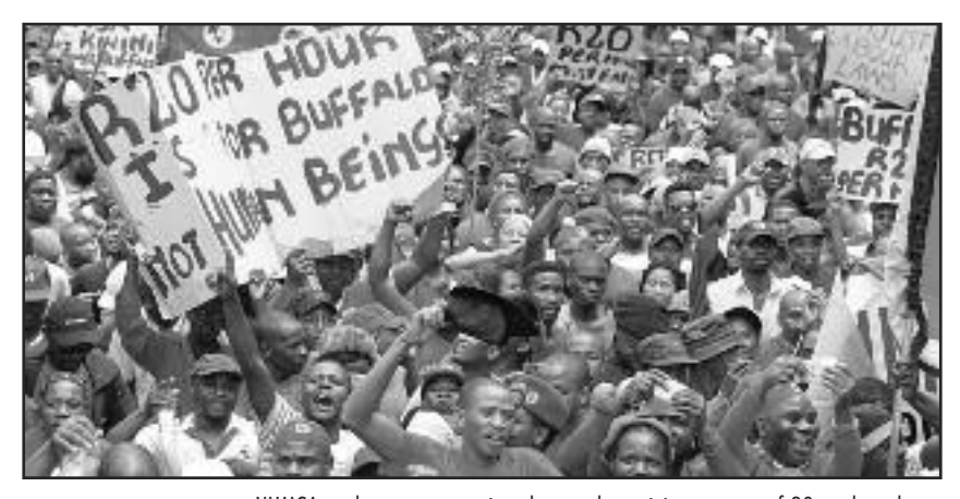
NUMSA workers protest against the very low minimum wage of 20 rands an hour

For the last two decades, the ANC government has waged an all-out assault on the African working class in order to defend White Monopoly Capital. The ANC has faithfully implemented the National Party's neo-liberal capitalist economic policies, starting with the Growth Employment and Redistribution policy (GEAR) and now the National Development Plan (NDP), both of which are the DA's economic policies in disguise, in order to please international rating agencies. These policies have resulted in massive job losses and long-