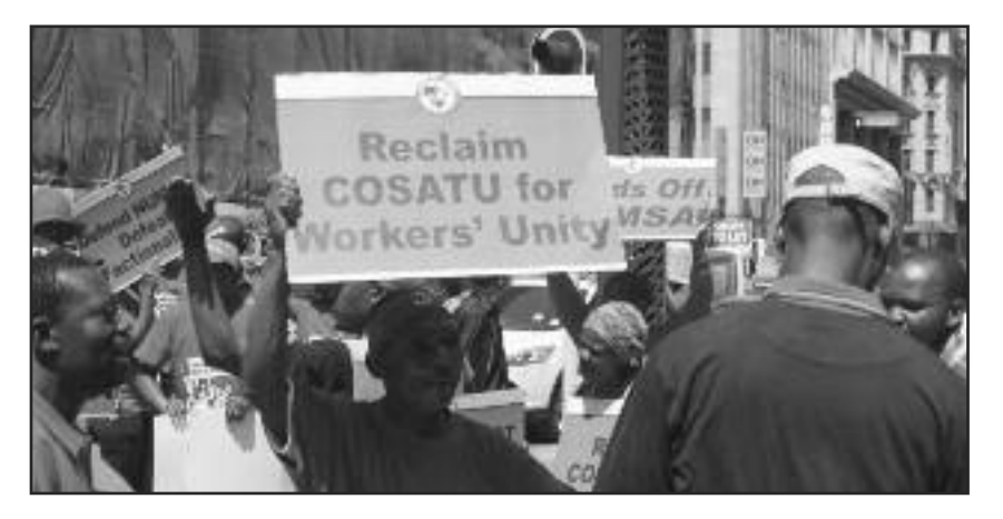
NUMSA protest: "Reclaim COSATU for Workers' Unity"

But in South Africa, unlike Zimbabwe, an alternative emerged to combat the attempt of the class-collaborationist leaders to subject the workers to the bourgeoisie, in this case, to Ramaphosa. In that trap they placed us, the Zimbabwean workers. And the sad thing of the case is that the ones who have done it are currents that call themselves socialists and leaders of the unions. It is clear that in our country we must conquer class independence and make thunder the revolutionary cry of the workers for socialism against the capitalists and imperialism that represses, massacres and oppresses us day by day.