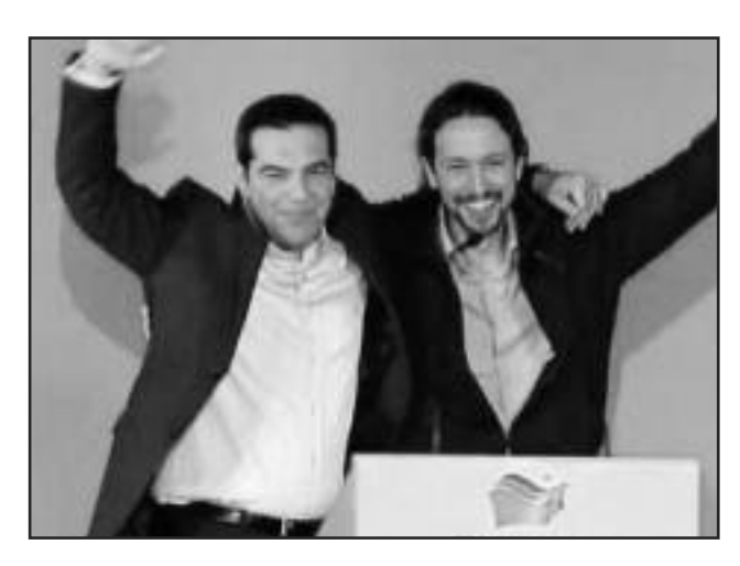
Tsipras of Syriza (Greece) and Iglesias of Podemos (Spanish State)

Against the postulates of the New Left and its vile deceptions of the workers' and youth's vanguard, the revolutionary socialists affirm that the question of power, of