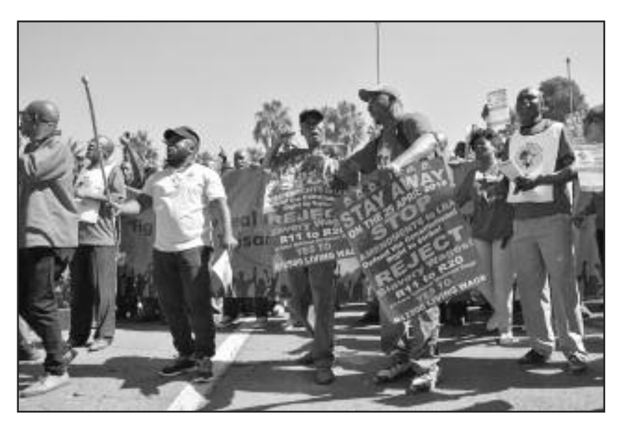
April 25th: general strike in South Africa called by SAFTU

It is time for proletarian internationalism. We are aware of the solidarity of the South African workers' organizations with the Palestinian people, who are suffering from true Apartheid by the Zionist occupier. We call to fight together with our