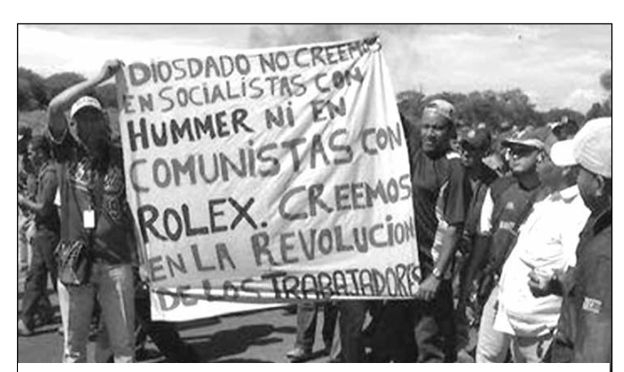
Venezuela 2014: Sidor workers on strike "We don't believe in socialists on Hummer, neither in communists with Rolex, we believe in the worker's revolution"

While the masses eat from the trash and millions run away from Venezuela, the bourgeois gangs of im-