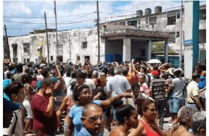
Street protests in Cuba

And now they are desperate because of an uprising for BREAD,