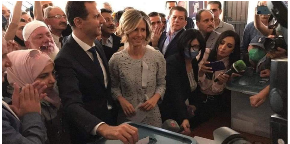
Al-Assad's farce of elections

The elections were the work of the Geneva conference, where the counterrevolutionary pact was signed after the outbreak of the Syrian revolution to centralize the different agents, such as Turkey, al-Assad, Putin, Iran, under the command of the US, each one of them playing its role. It is from Geneva that a coordinated action among them has been