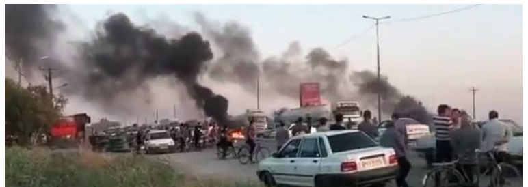
Roadblock in Khuzestan

Let's march to the barracks to find the common soldiers so that they go over to the side of the people!