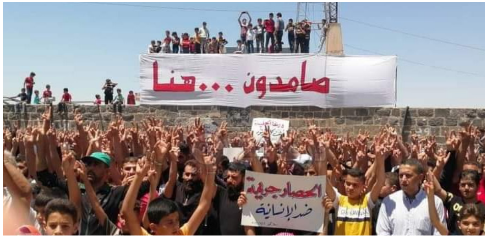
Daraa resistance does not give up

Open the fronts with the refugees and displaced for them to enter the fight for a decent living, recovering the houses