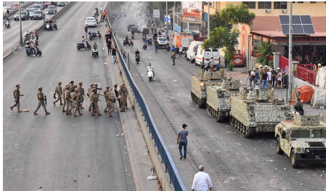
Beirut: The masses confront the crackdown of the army

On that same day, the dollar increased from 19,000 to 21,000 Lebanese pounds. There are gasoline and medicines shortage, and there is no electricity. Fed up with this situation, the masses returned to the streets. They cut off the main routes in the country. There were protests in the main cities such as Beirut, Tripoli, Sidon and Tire, in which there were clashes with the army, which went to dislodge the roadblocks with tear gas and tanks. Just the day before, the masses had entered the