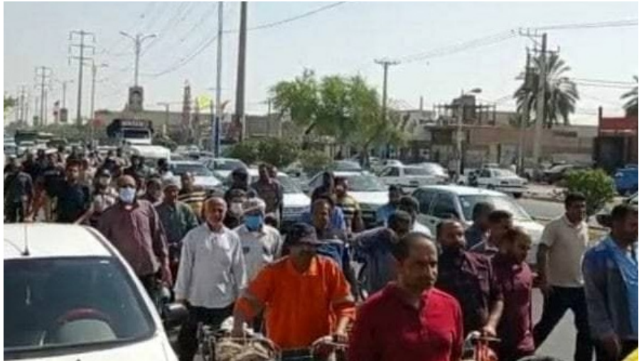
Haft Tappeh sugarcane workers on strike marching and joining the struggle

The clerics live as kings and the people live as beggars! Down with the murderous regime of the Iranian theocracy! Out with imperialism