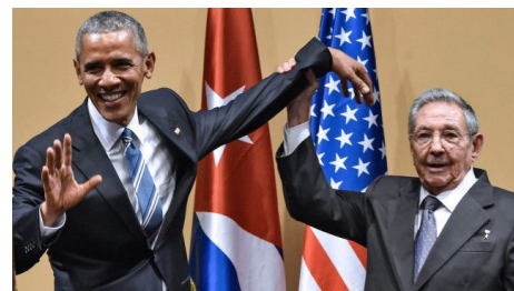
Former president of the US, Obama, with Raul Castro

And they accuse the starving masses of being agents of imperialism? ...the bankruptcy of socialism in a single country, the betrayal of the revolution in the American continent by the Cuban CP, the subjugation imposed on the American working class to support Biden and interrupt their revolutionary struggle