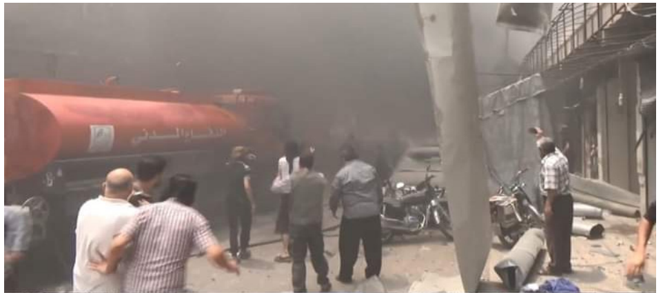
Month-long daily bombing on Jebel al Zawiya by the war criminals al-Assad and Putin

Despite such counterrevolution in ten years, of the aforementioned international support to al-Assad, of the siege to the revolution in Syria and the handing over of the rebel cities one by one by the Sunni bourgeois generals, the Syrian resistance marches over and over again with the war cry "the revolution continues" in Idlib. In Daraa, despite the city being handed over by the FSA 3 years ago, the resistance keeps marching against the regime. There are daily protests and clashes with al-Assad's army, sometimes cities of the southern governorate have been liberated with huge uprisings. The counterrevolution is not settled completely.