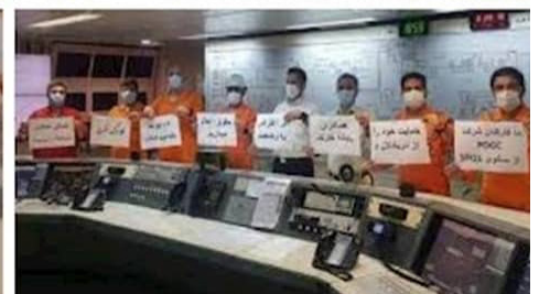
Oil workers strike all across Iran

the supreme ayatollah and Iran's top ruler.