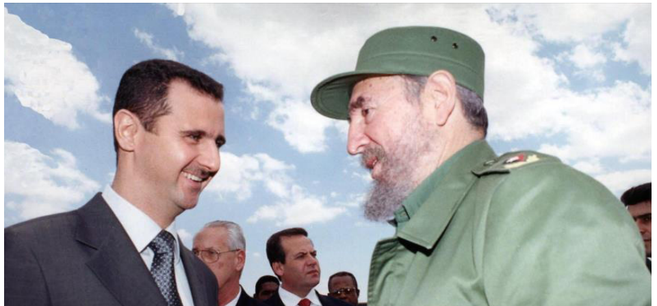
al-Assad and Fidel Castro

The Bolibourgeoisie and the representatives of the Castro regime will go there, speaking in the name of “socialism”, to legitimize the greatest slaughterers of the people. The Maduros, who speak of “socialism of the 21st century” while millions of exploited eat in the garbage and flee from Venezuela,