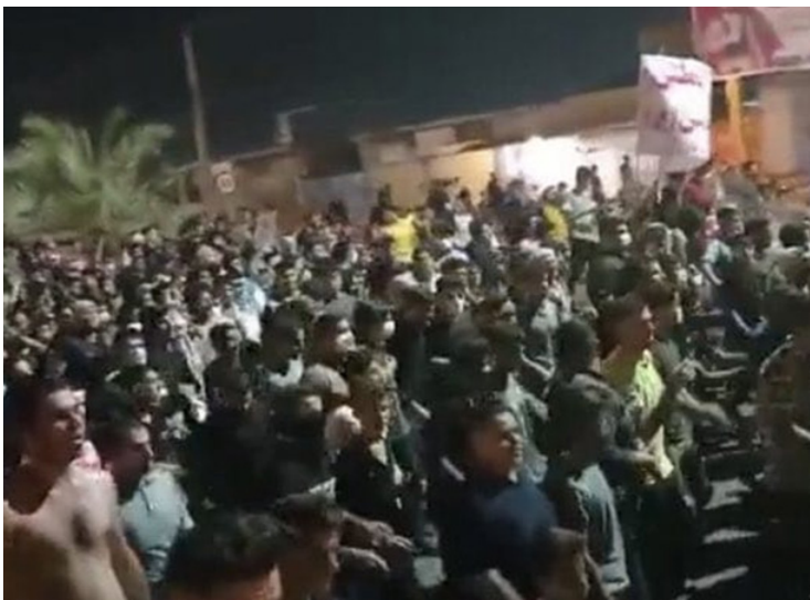
The masses take to the streets in Khuzestan (Iran)

They fight for bread, water and against the regime of the dictatorship of the Ayatollahs