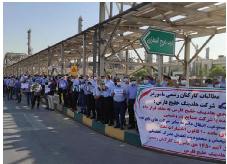
Iranian oil workers on strike