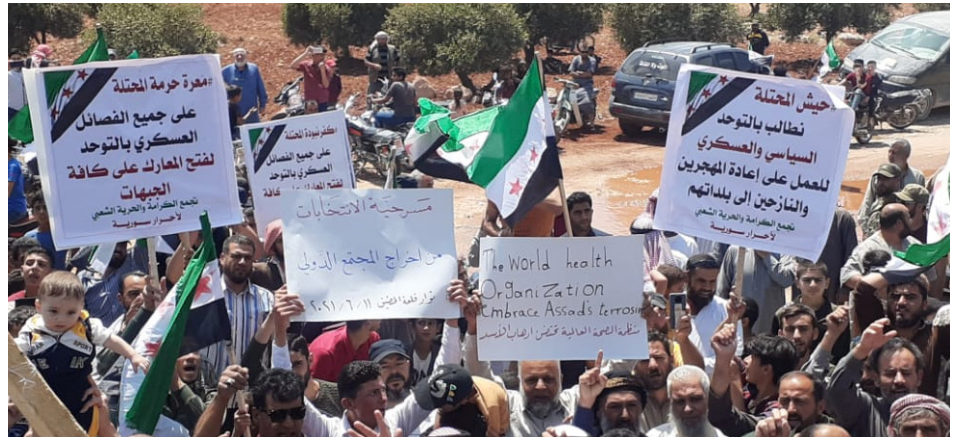
Demonstrations in Idlib against Assad and his illegitimate elections

In the opposite trench: Putin, Lukashenko, Khamenei, Nasrallah, the Bolivarians of Bolivia and Venezuela, and the Castroites... all of them supporting al-Assad. He also received the support of the Palestinian bourgeoisie, from Fatah to Hamas, separating the Palestinian masses from their allies of the Syrian revolution and fencing the latter from international solidarity, as they have been doing during the last 10 years. In turn, Assad received the support of Stalinism at world level, from the bureaucracy of the trade unions and from their parties in all the coun-