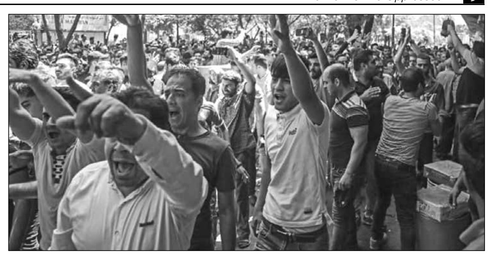
Iran: demonstration against the regime of the Ayatollahs

The heads rolled down of Qadafy in Libya, Mubarak in Egypt and Ben Ali in Tunisia. The revolution started in Bahrain, Yemen... In Syria, people was fighting 30 blocks away from al-Assad's government palace. The