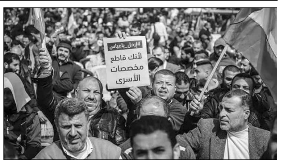
Demonstration of the Palestinian masses of Gaza

Today, the masses of Daraa, the city where the Syrian revolution began in 2011, are coming out to fight again. That city was sold out by the